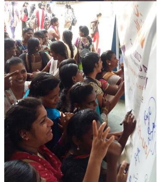
Students partaking in the signature campaign