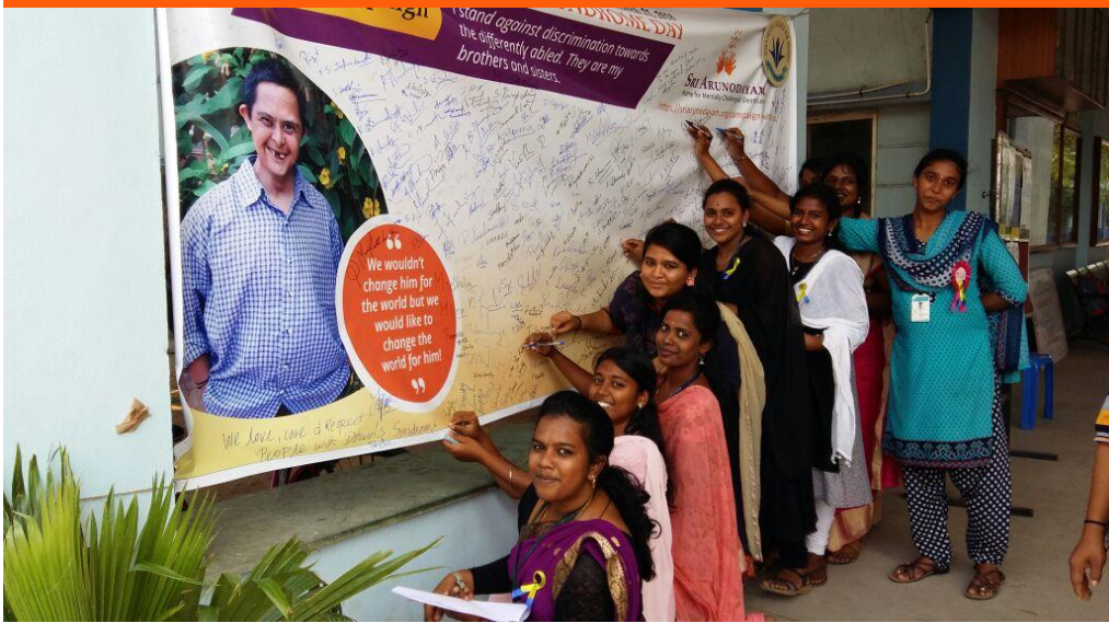
Signature campaigns at two colleges in the city