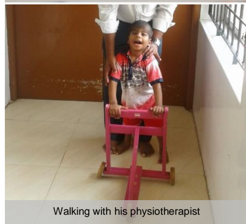
Walking with his physiotherapist